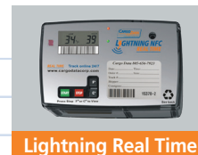
Lightning Real Time