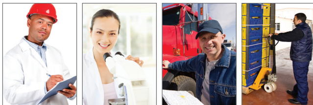
Quality Control Food Safety Carrier Supplier

Now the temperature data is available to everyone!